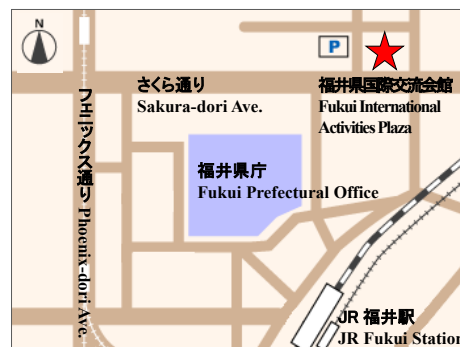
【Access】 10 minute walk from JR Fukui Station.