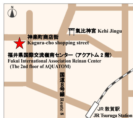
【Access】 20 minute walk from JR Tsuruga Station.