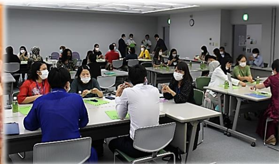
【Appointment Ceremony and Training】